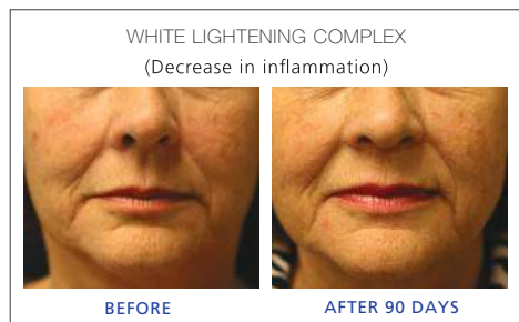
Before-and-after subject photo showing decreased inflammation of cheek area with 90 days of product use.

Furthermore, a positive ORAC score would also explain, verify, and further support the finding seen in before-and-after subject photos illustrating decreasing inflammation with product use.